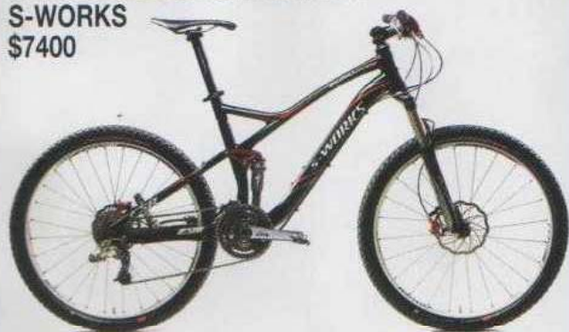
SPECIALIZED STUMPJUMPER S-WORKS $7400