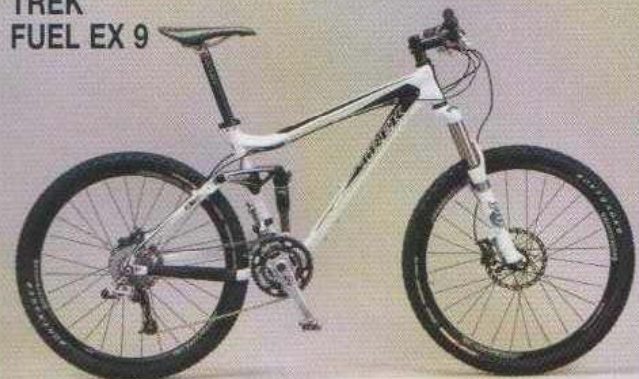
TREK FUEL EX 9